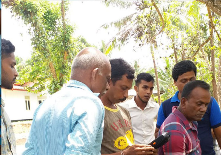
Rasota Tea Factory - Galle