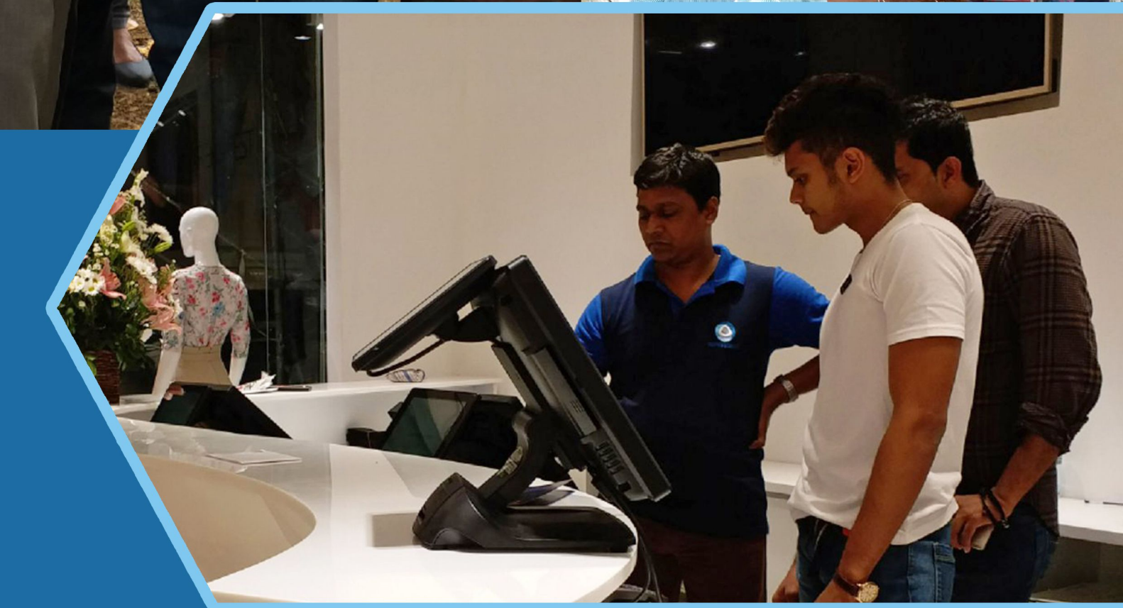
GFlock - Colombo 03